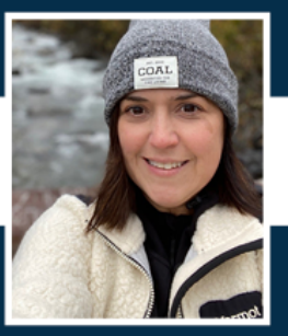
Erin Stoesz North & South Seafood & Smokehouse