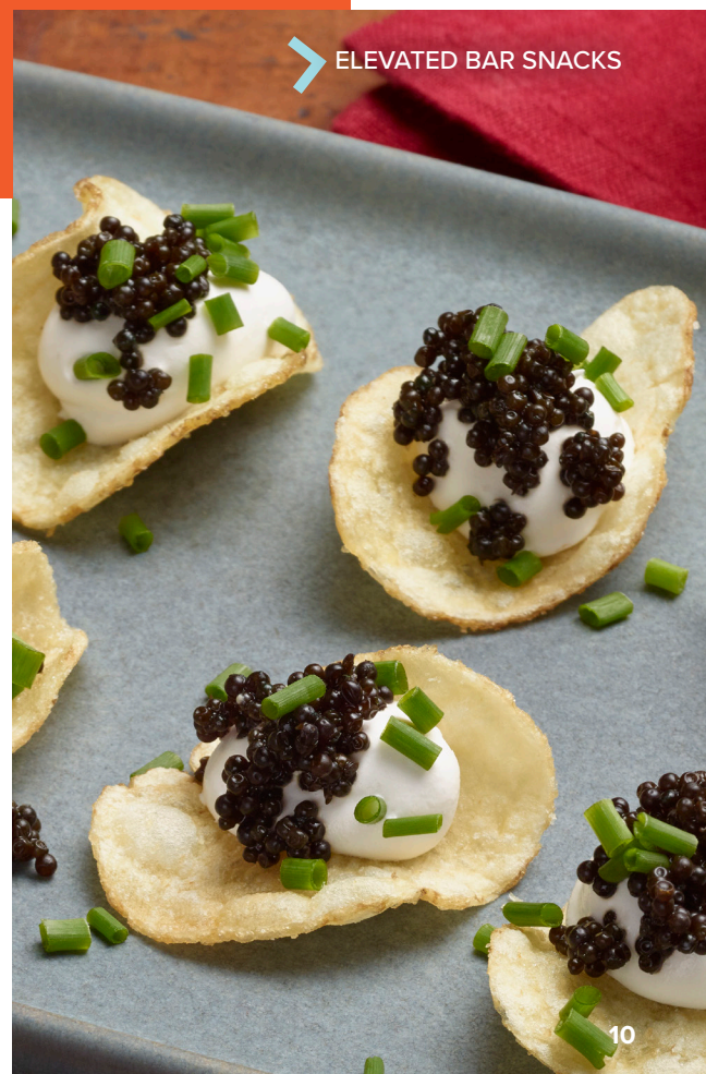
▶ ELEVATED BAR SNACKS