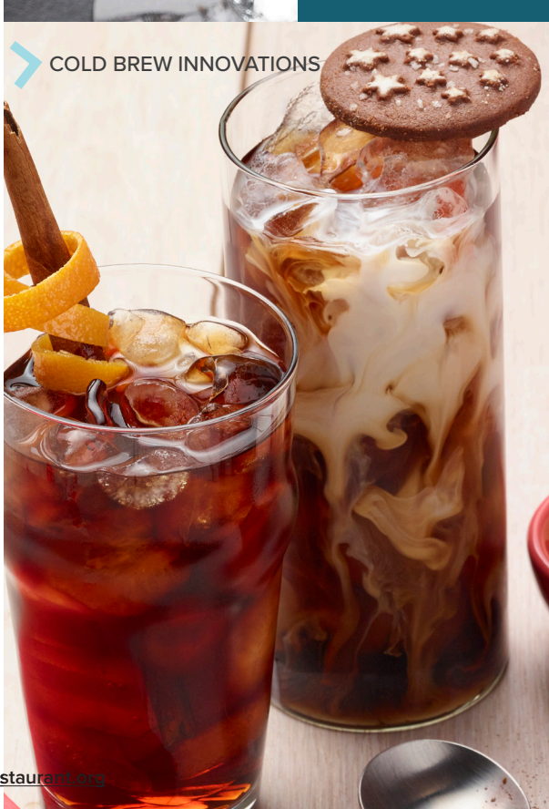
COLD BREW INNOVATIONS