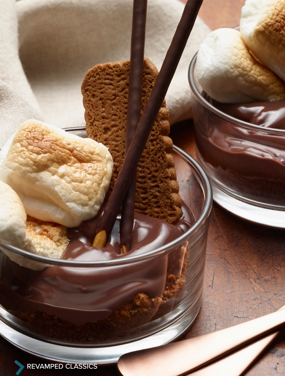
▶ REVAMPED CLASSICS