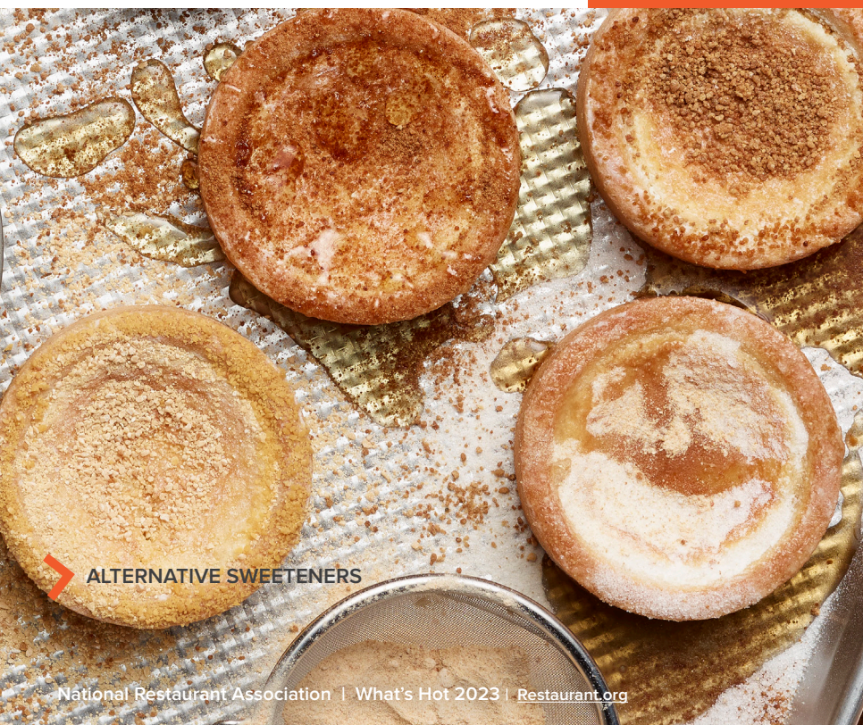
▶ ALTERNATIVE SWEETENERS