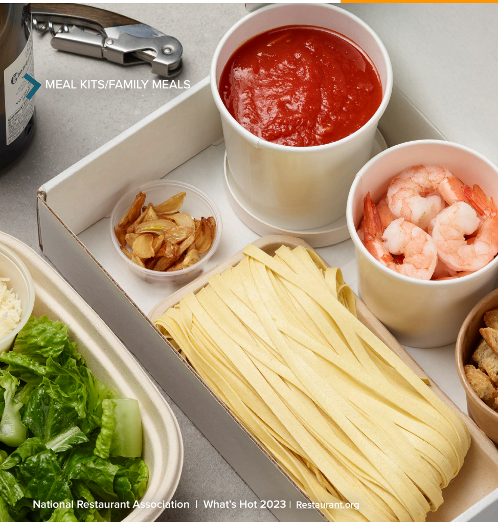
MEAL KITS/FAMILY MEALS