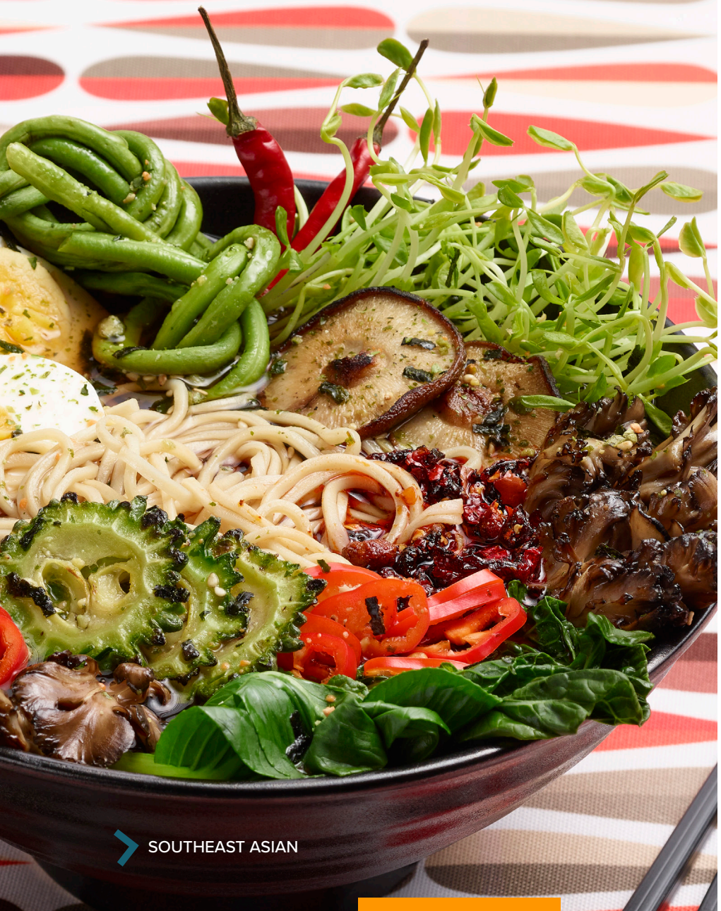
➤ SOUTHEAST ASIAN